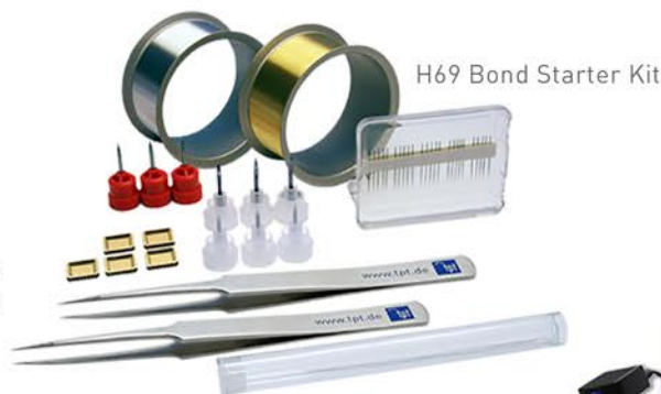
H69 Bond Starter Kit