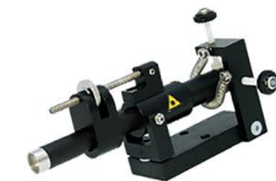
H50 Spotlight Targeting System