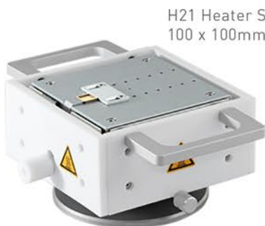
H21 Heater Stage 100 x 100mm