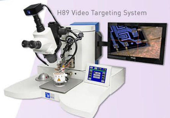
H89 Video Targeting System

Specifications are subject to change without prior notice