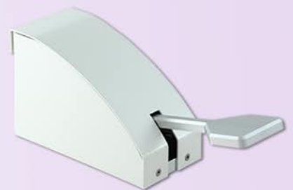
H51 Manual Z-Axis Control