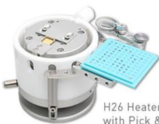
H26 Heater Stage with Pick & Place