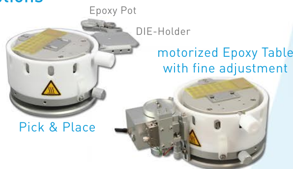
Pick & Place