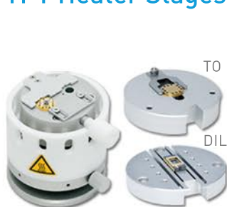
Exchangeable heater plates