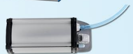
H76 Vacuum Pump

Specifications are subject to change without prior notice