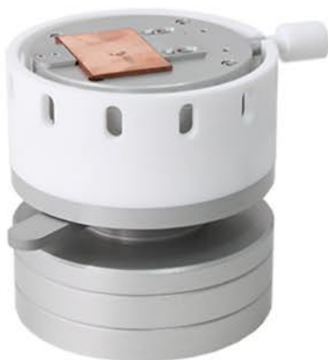
H28 Stage Ø 90mm