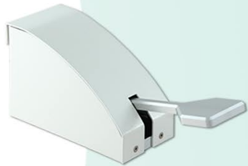
H51 Manual Z-Axis Control