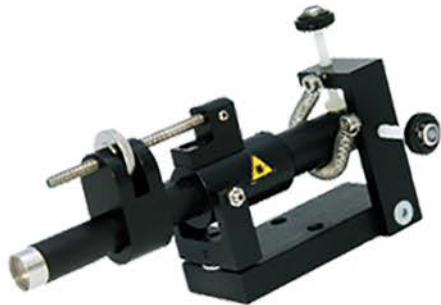
H50 Spotlight Targeting System