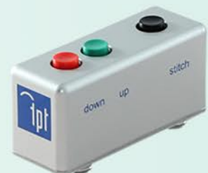
H52 Dynamic Search