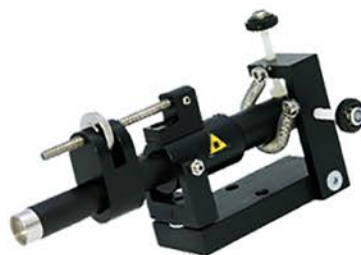
H50 Spotlight Targeting System