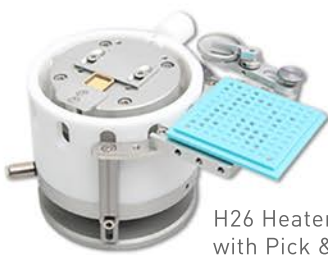
H26 Heater Stage with Pick & Place