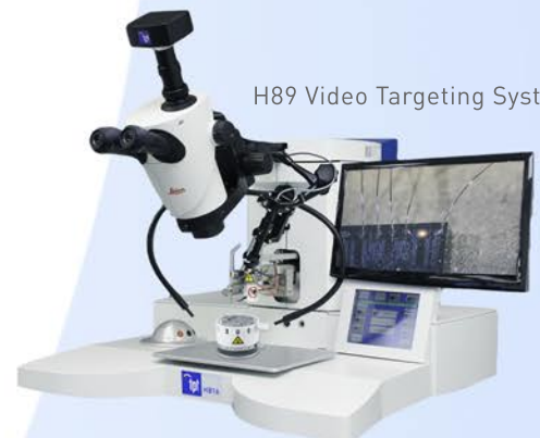
H89 Video Targeting System