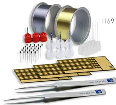
H69 Bond Starter Kit