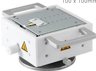
H21 Heater Stage 100 x 100mm