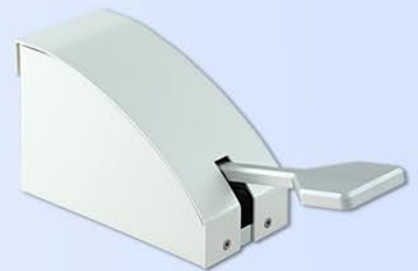
H51 Manual Z-Axis Control