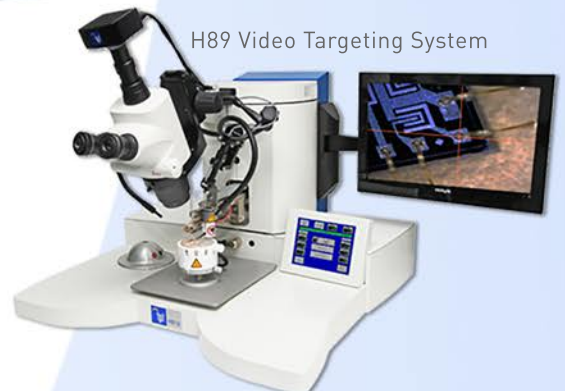
H89 Video Targeting System