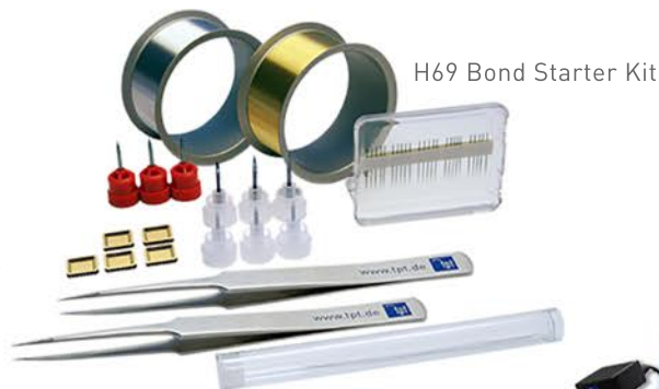
H69 Bond Starter Kit