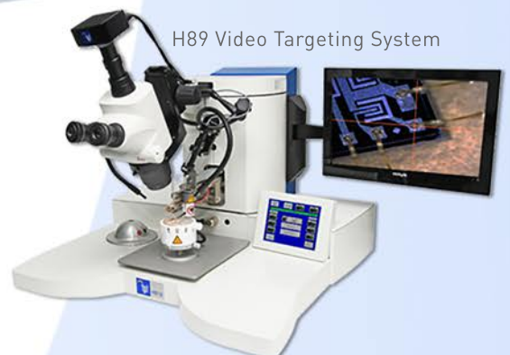
H89 Video Targeting System