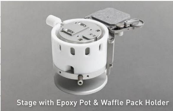
Stage with Epoxy Pot & Waffle Pack Holder

The H80 Pick & Place extension kit does not require a bond head change. Fast and easy change of bond tools lets you switch from die bonding to wire bonding and back.