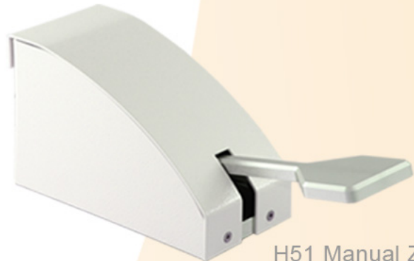
H51 Manual Z

Specifications are subject to change without prior notice