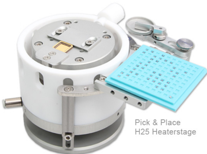
Pick & Place H25 Heaterstage