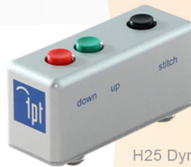
H25 Dynamic Search