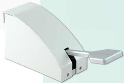
H51 Manual Z-Axis Control