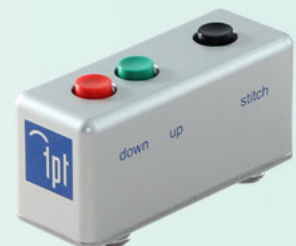
H52 Dynamic Search

Specifications are subject to change without prior notice