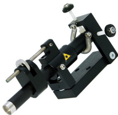
Spotlight tagetting system